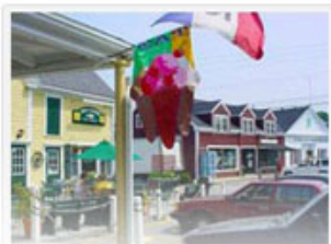
The downtown area.

If you're ready to hit the beach, we have the place for you. Duxbury , Massachusetts is located along the Atlantic coast in Plymouth County, and it's the perfect spot for a weekend drive. Widely known for the beautiful Duxbury Beach , the town is visited by thousands each summer who come with towels in hand to take advantage of the 6-mile long barrier beach extending from the north to Gurnet Point and Saquish in the south. After a long day in the hot sun, nothing can beat a stop at Farfar's Danish Ice Cream Shop for delicious home-made ice cream, a summer staple in Duxbury.