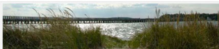
A view of Duxbury Beach.

If you're ready to hit the beach, we have the place for you. Duxbury , Massachusetts is located along the Atlantic coast in Plymouth County, and it's the perfect spot for a weekend drive. Widely known for the beautiful Duxbury Beach , the town is visited by thousands each summer who come with towels in hand to take advantage of the 6-mile long barrier beach extending from the north to Gurnet Point and Saquish in the south. After a long day in the hot sun, nothing can beat a stop at Farfar's Danish Ice Cream Shop for delicious home-made ice cream, a summer staple in Duxbury.